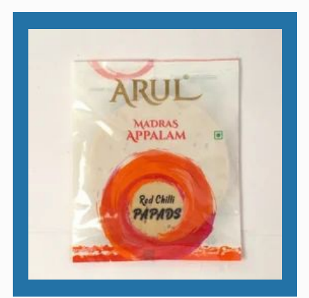
Red Chilli Papad