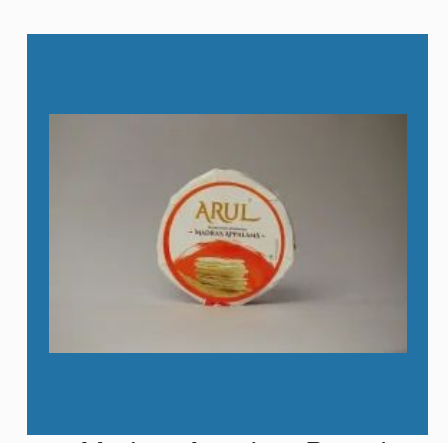
Madras Appalam Papad