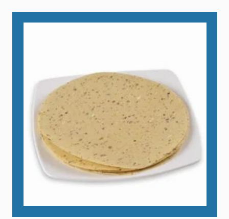
North Indian Papads