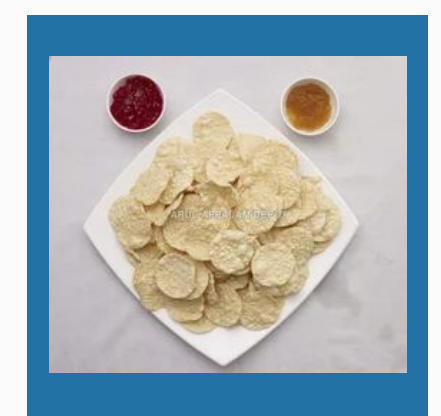
Mini Plain Pappadums