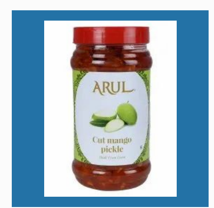
Cut Mango Pickle