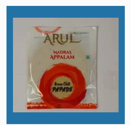
Green Chilli Papad