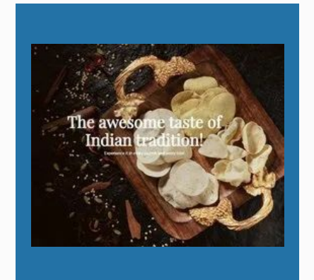
Indian Spiced Appalam, papad