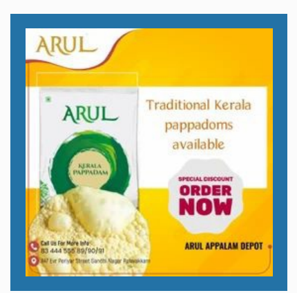
Kerala Appalam Papad