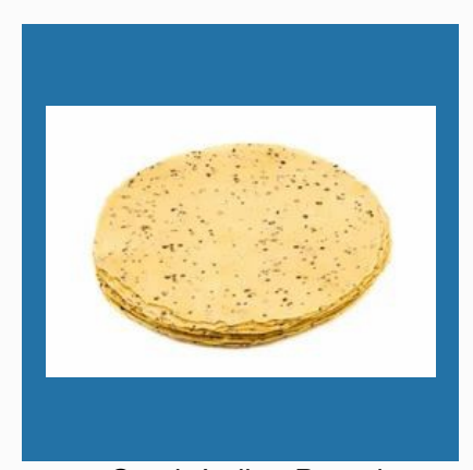
South Indian Papad