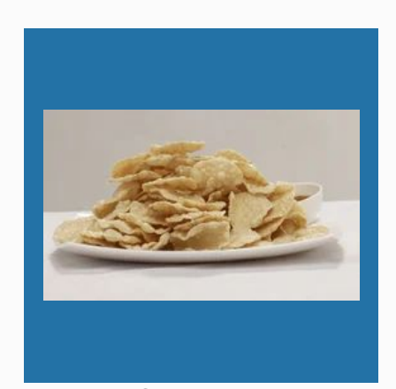
Mini Garlic Pappadum