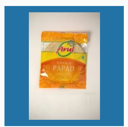
Punjabi Masala Papad