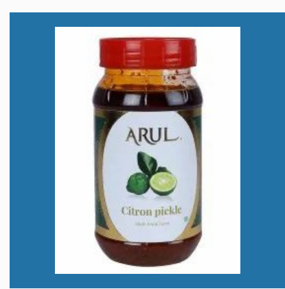
Pickles 300 gm, 1kg & 5 kg Jar