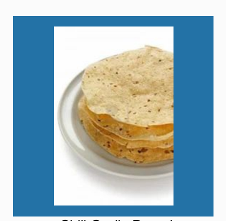
Chili Garlic Papad