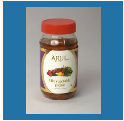
Mixed Vegetable Pickle