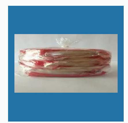
Madras Plain Pappadams