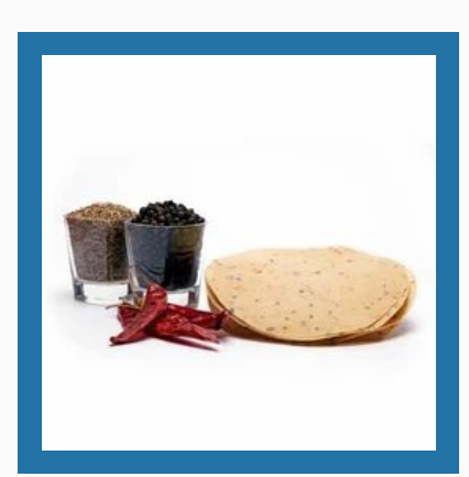
Red Chilli Appalam