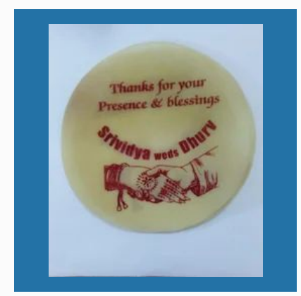
Printed Applam Papad