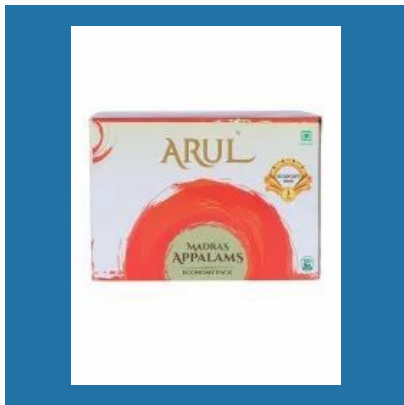
Madras Appalams Economy Pack